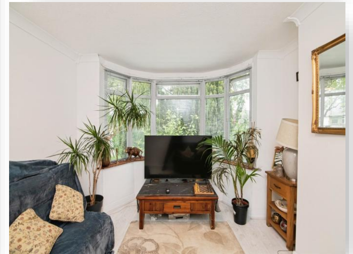
Hillyfields Road, Birmingham B23 7HA