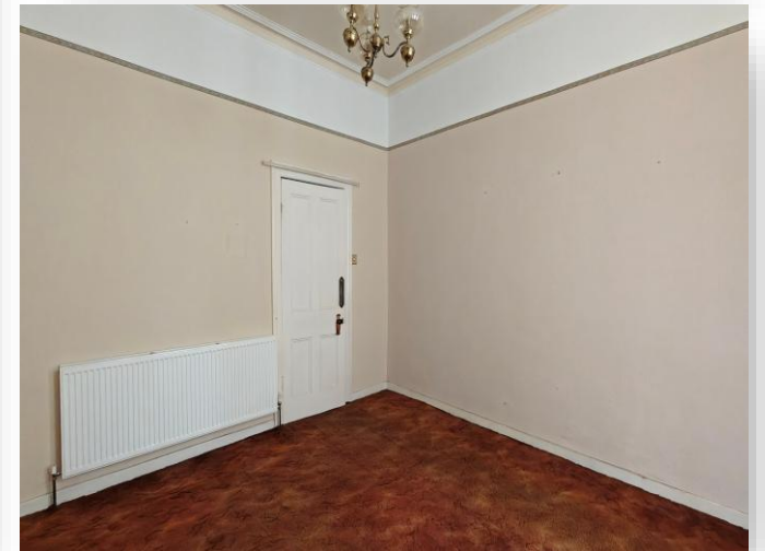
Orrell Road, Wallasey, CH45 1HX