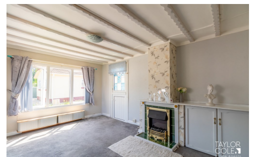
Amington Park Amington, Tamworth, B77 3AX