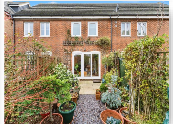
Heron Way, Benwick PE15 0UA