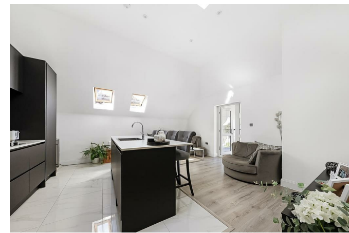
Hartley Old Road Purley, CR8

Approximate Gross Internal Area 65.3 sq m / 703 sq ft