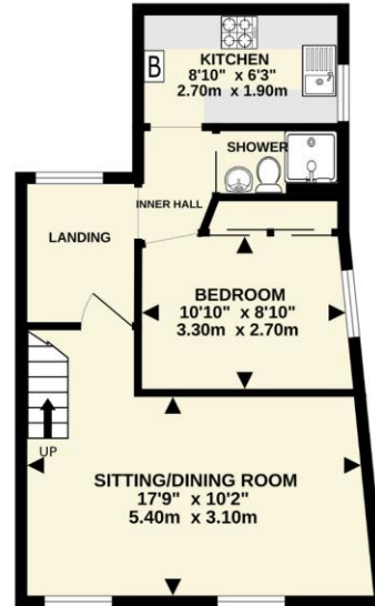
1ST FLOOR FLAT 425 sq.ft. (39.4 sq.m.) approx.