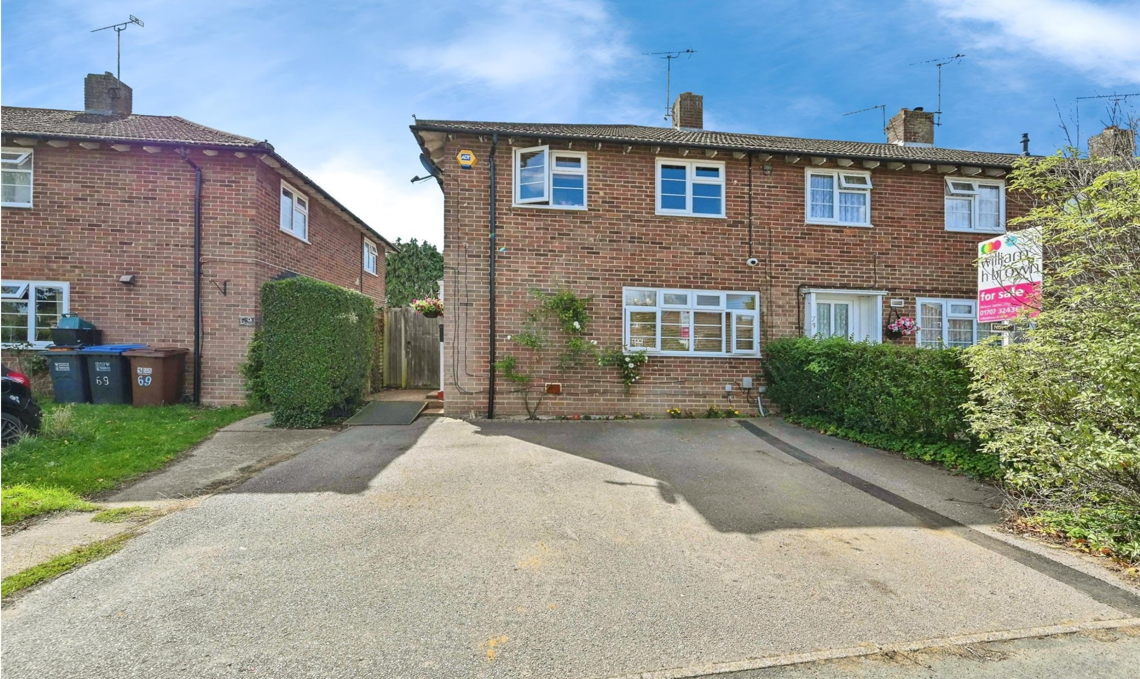
Golden Dell, Welwyn Garden City AL7 4EE