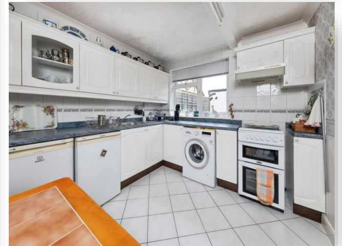
Woodrush Close, Beanhill, Milton Keynes, MK6 4LU