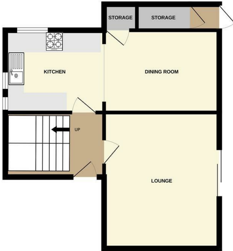
1ST FLOOR 487 sq.ft. (45.3 sq.m.) approx.