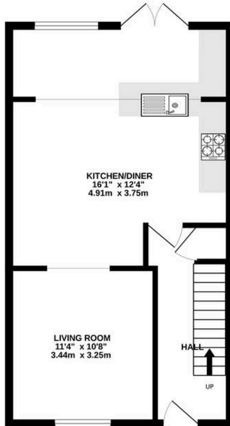
GROUND FLOOR 467 sq.ft. (43.3 sq.m.) approx.