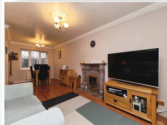
Coulby Manor Farm, Coulby Newham Middlesbrough TS8 0RY