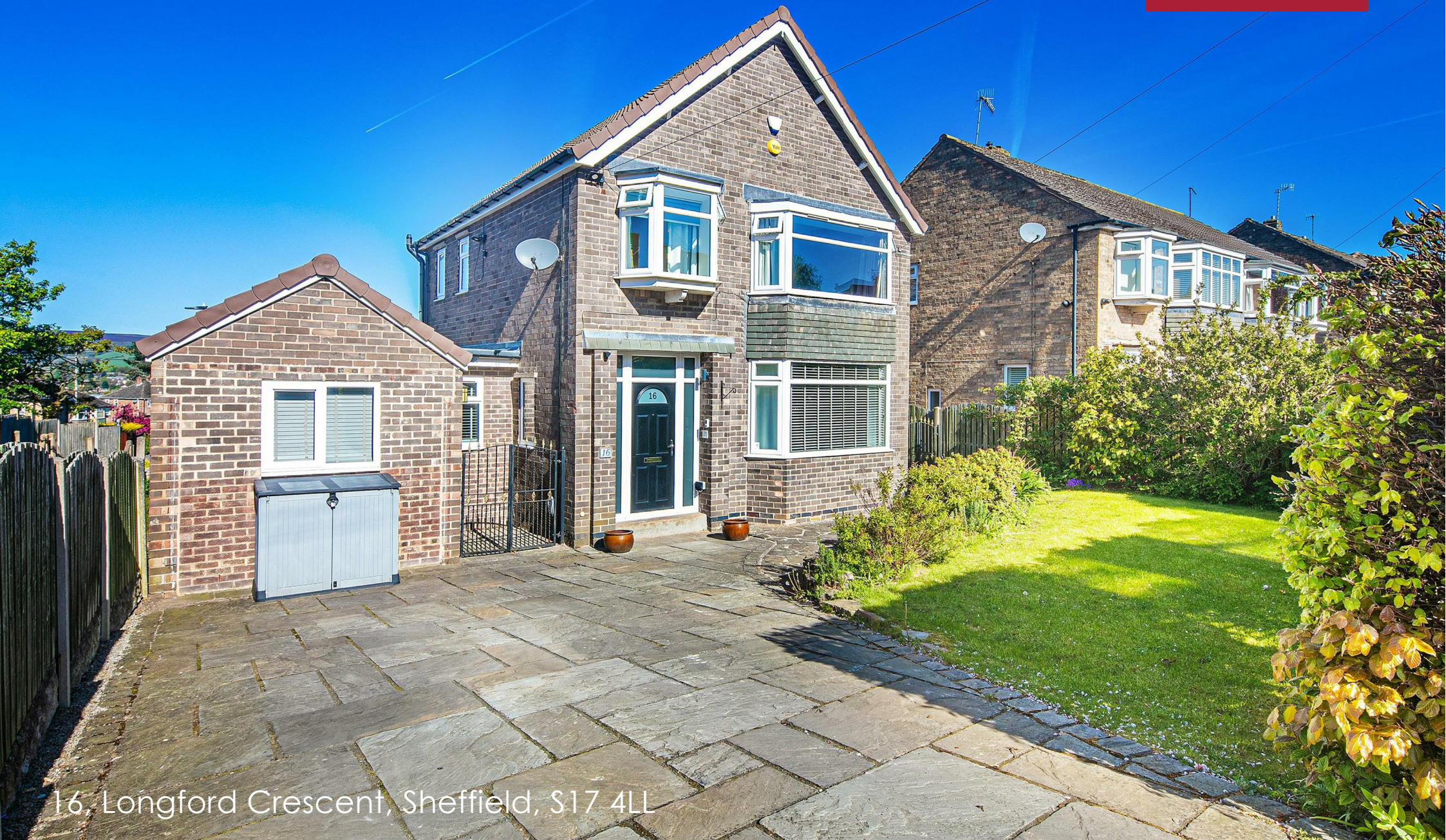
16, Longford Crescent, Sheffield, S17 4LL