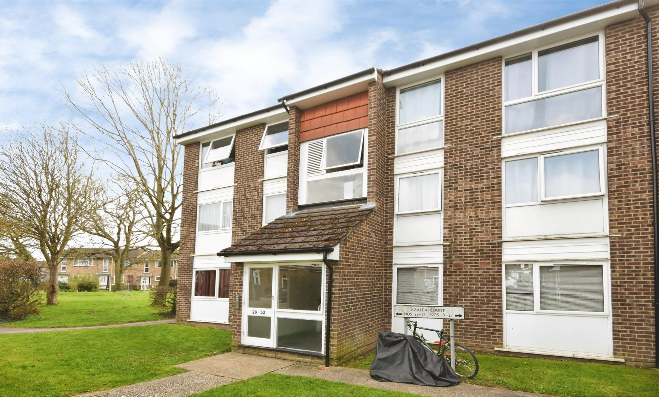
Azalea Court, Springfield Chelmsford CM1 6YL