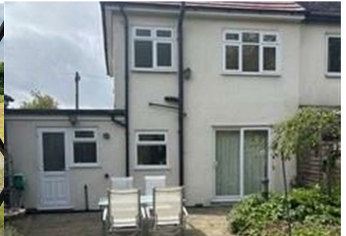
View To Front