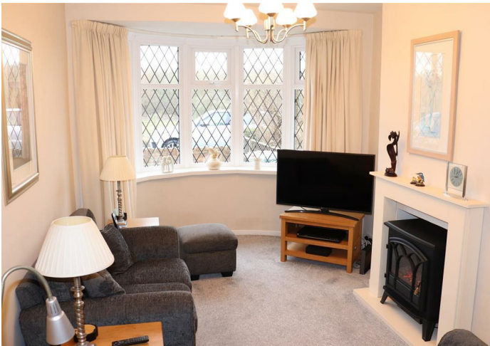
Through Lounge/Dining Room