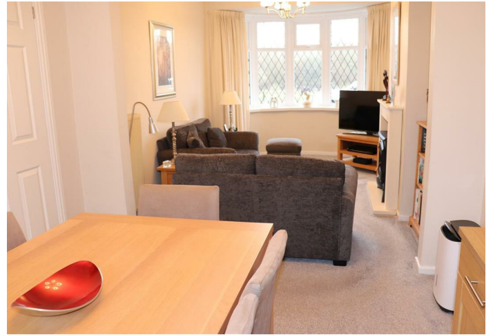
Through Lounge/Dining Room