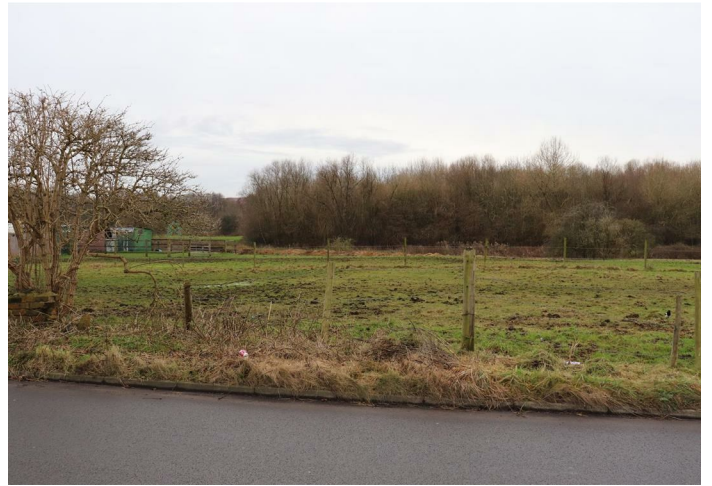
View To Front