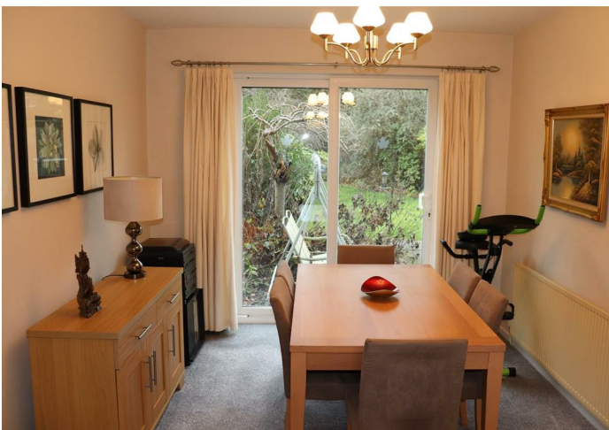
Through Lounge/Dining Room