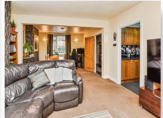
The Avenue, WESTBURY BA13 3HF