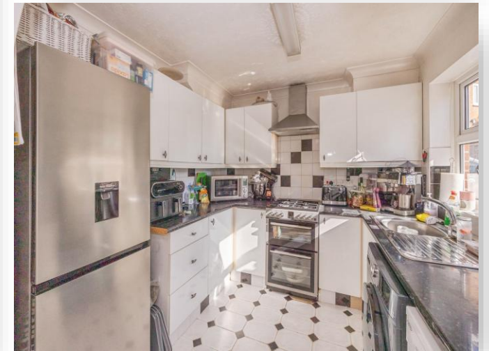
Monterey Drive, Havant PO9 5TQ