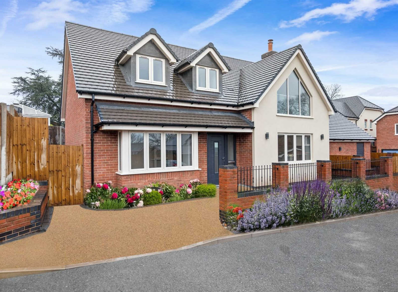
Pumphouse Lane, Redditch