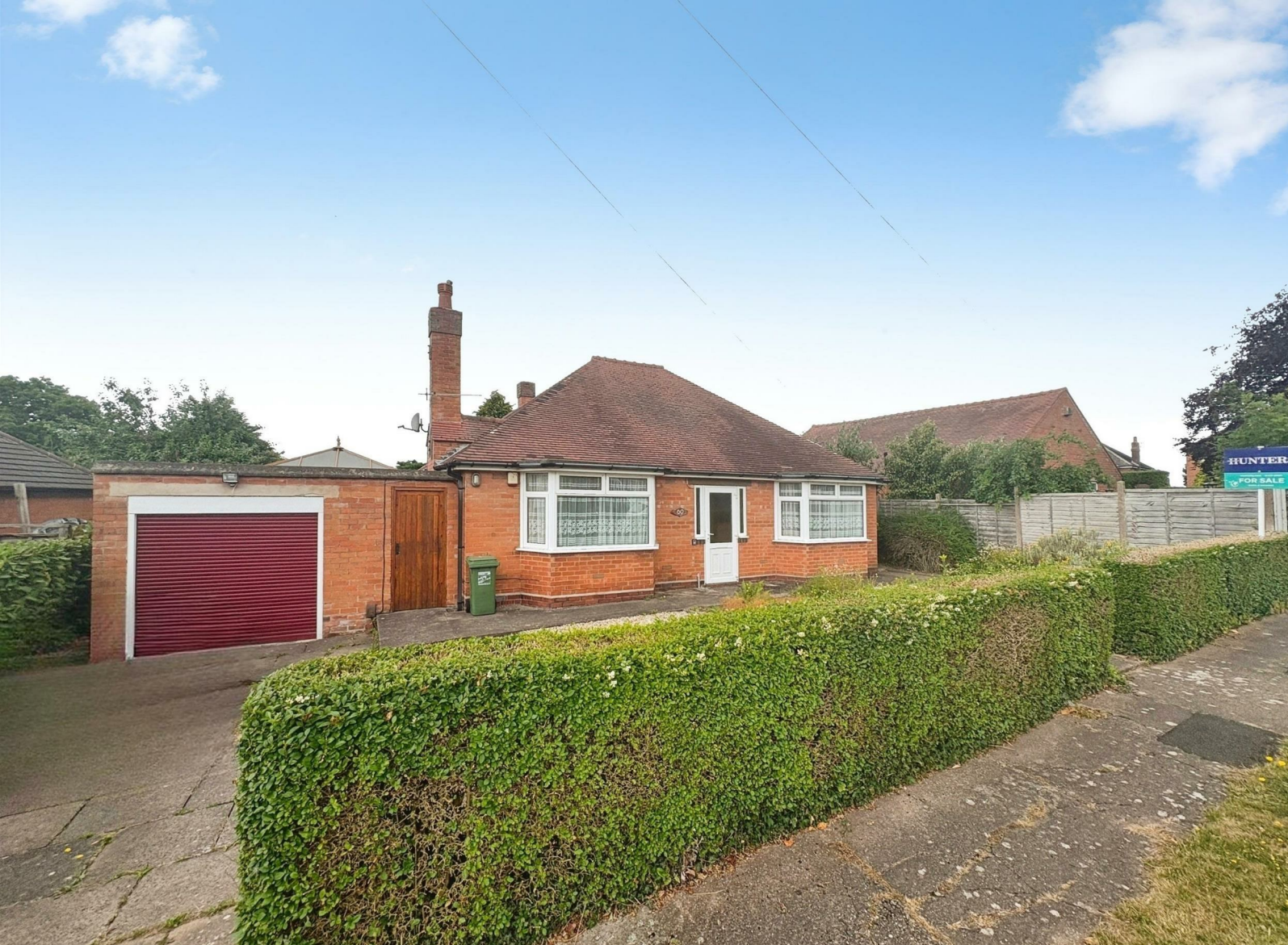
Chandlers Close, Redditch