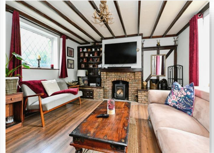
Platts Corner, Terrington St. Clement, King's Lynn, PE34 4PX