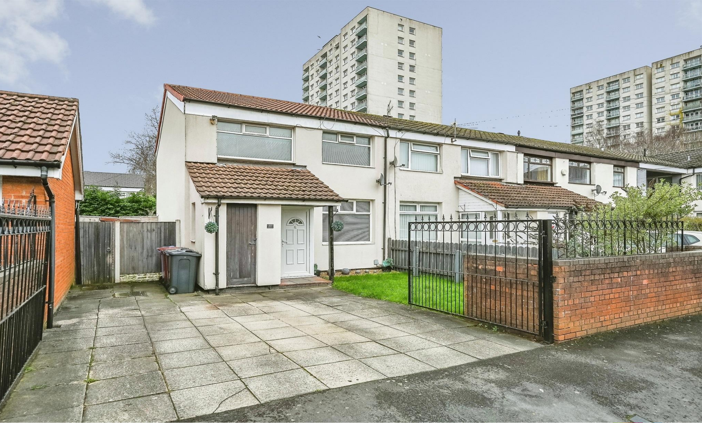
Terret Croft, Liverpool L28 6YB