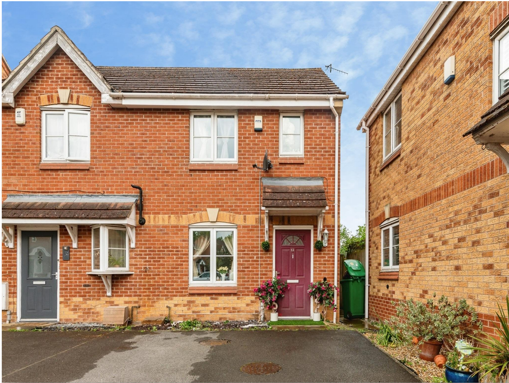
The Poplars, Nottingham NG7 5HA