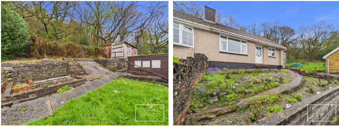
Terraced front garden with plants & shrubs. Driveway and carport to side. Terraced rear garden backing onto woodland.