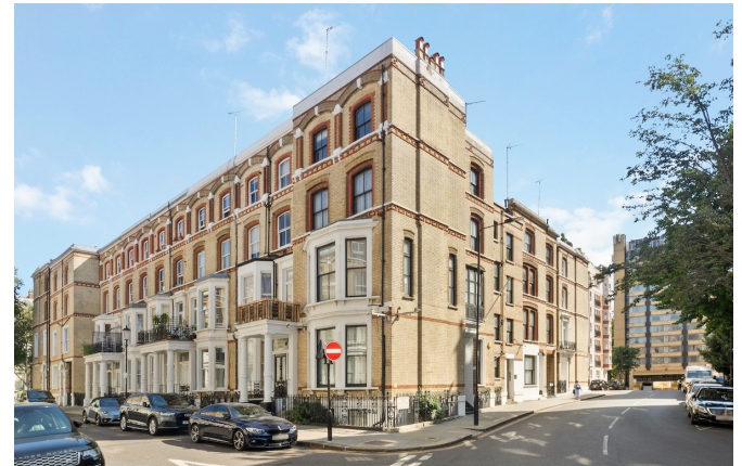
CHENISTON GARDENS W8