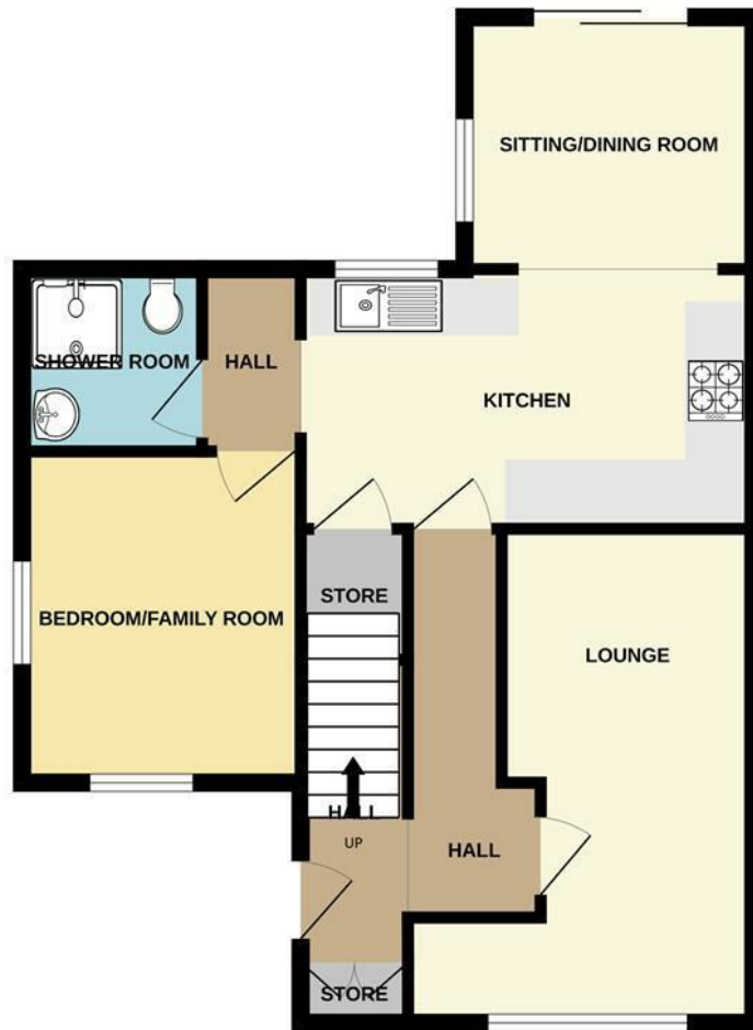
GROUND FLOOR 575 sq.ft. (53.5 sq.m.) approx.