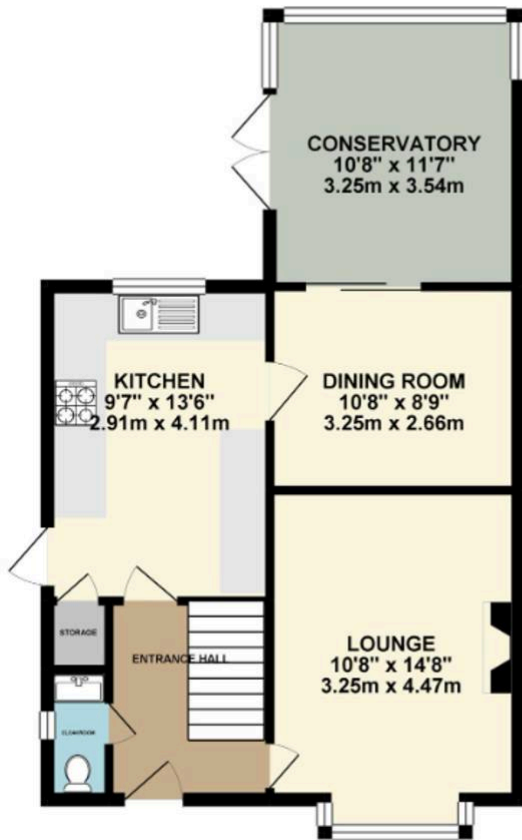
GROUND FLOOR 576.48 sq. ft. ( 53.56 sq. m. )