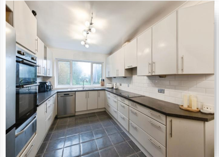
Stanway Road, Shirley Solihull B90 3JF