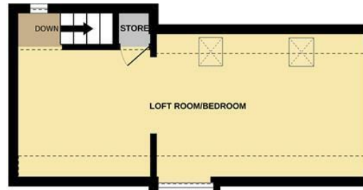
2ND FLOOR 206 sq.ft. (19.2 sq.m.) approx.