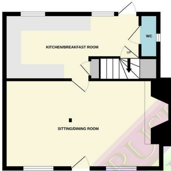
GROUND FLOOR 429 sq.ft. (39.9 sq.m.) approx.