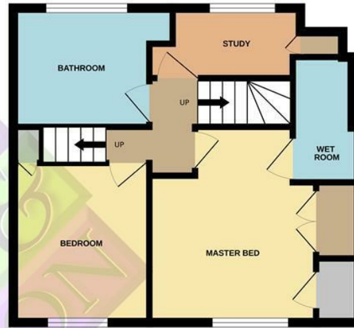
2ND FLOOR 206 sq.ft. (19.2 sq.m.) approx.