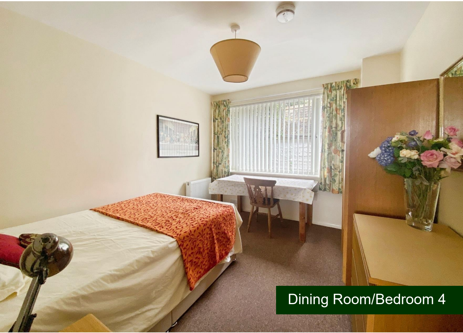
Dining Room/Bedroom 4