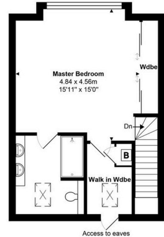
2nd Floor Approx. Gross Internal Area 38.3 m 2 ... 413 ft 2

Total Approx. Gross Internal Area 139.5 m 2 ... 1502 ft 2 (excluding balcony)