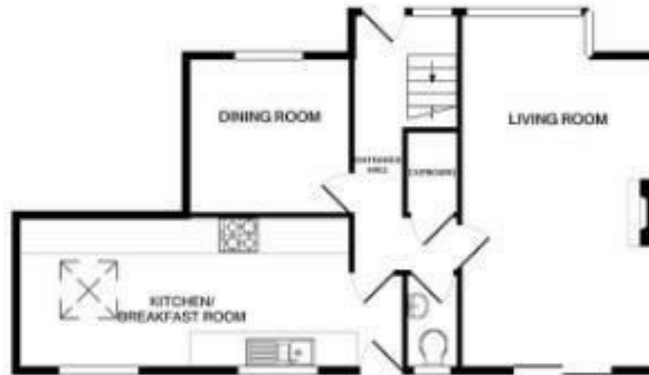
GROUND FLOOR APPROX. FLOOR AREA 620 SQ. FT. (57.6 SQ.M.)