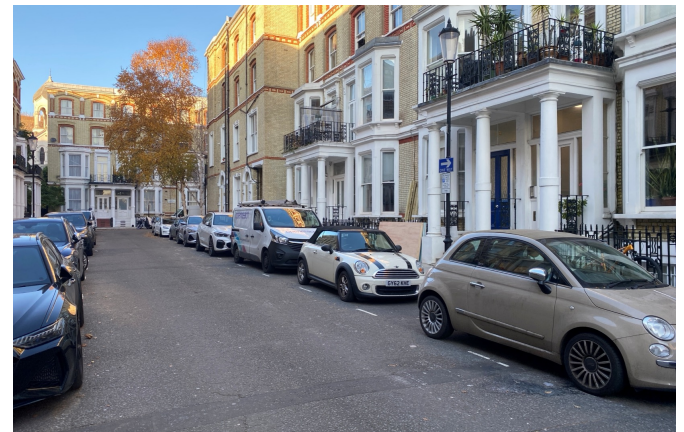
CHENISTON GARDENS W8