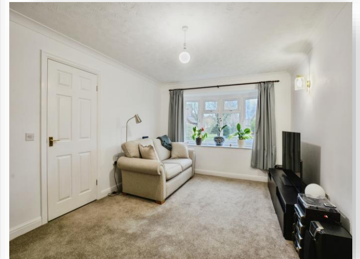
Stanley Close, Wainfleet Skegness PE24 4PD