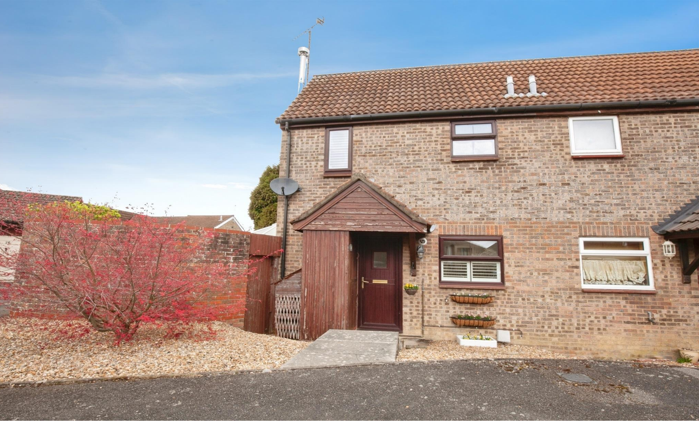
Stonefield Way, BURGESS HILL, RH15 8SG