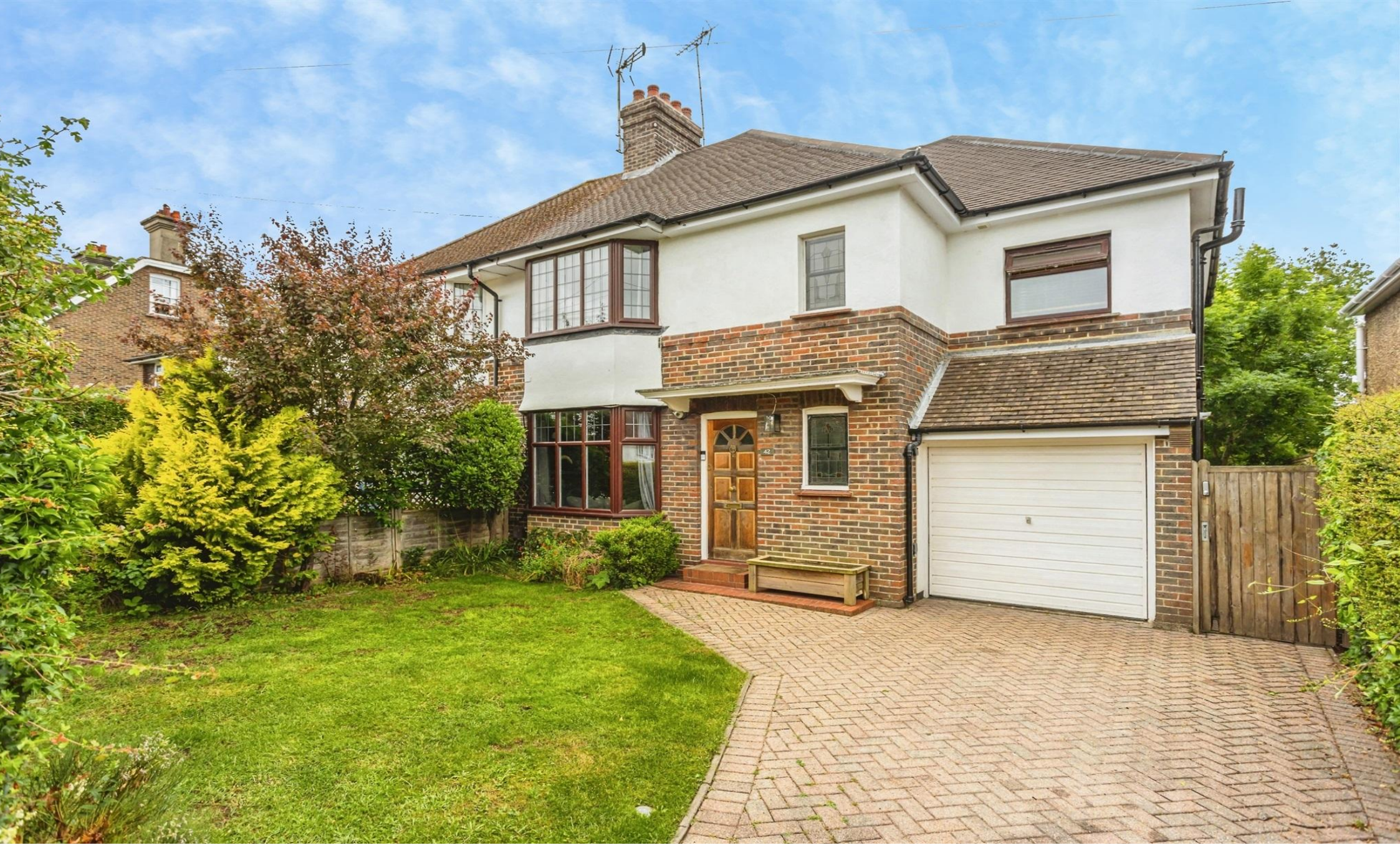
Crescent Road, Burgess Hill, RH15 8EG