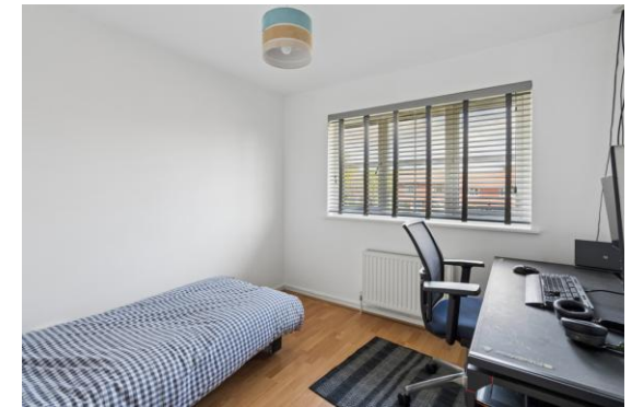
Illustration for identification purposes only, measurements are approximate, not to scale.