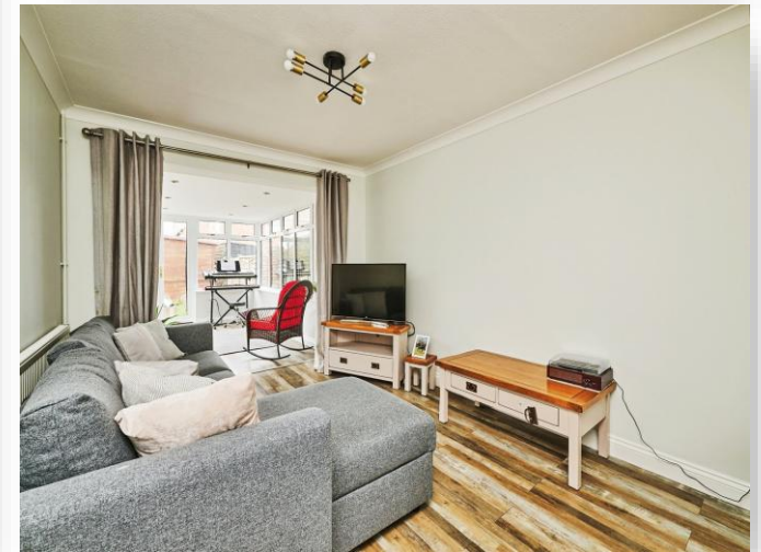
Elm Road, Folksworth Peterborough PE7 3SX