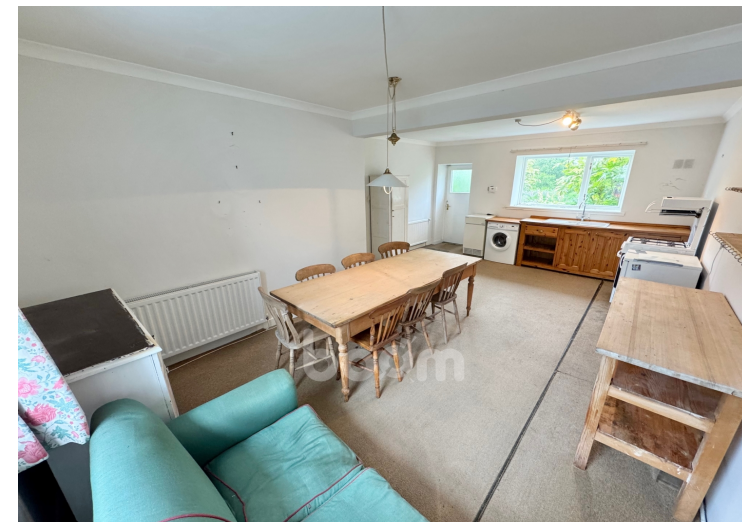
Calder Street, Lochwinnoch