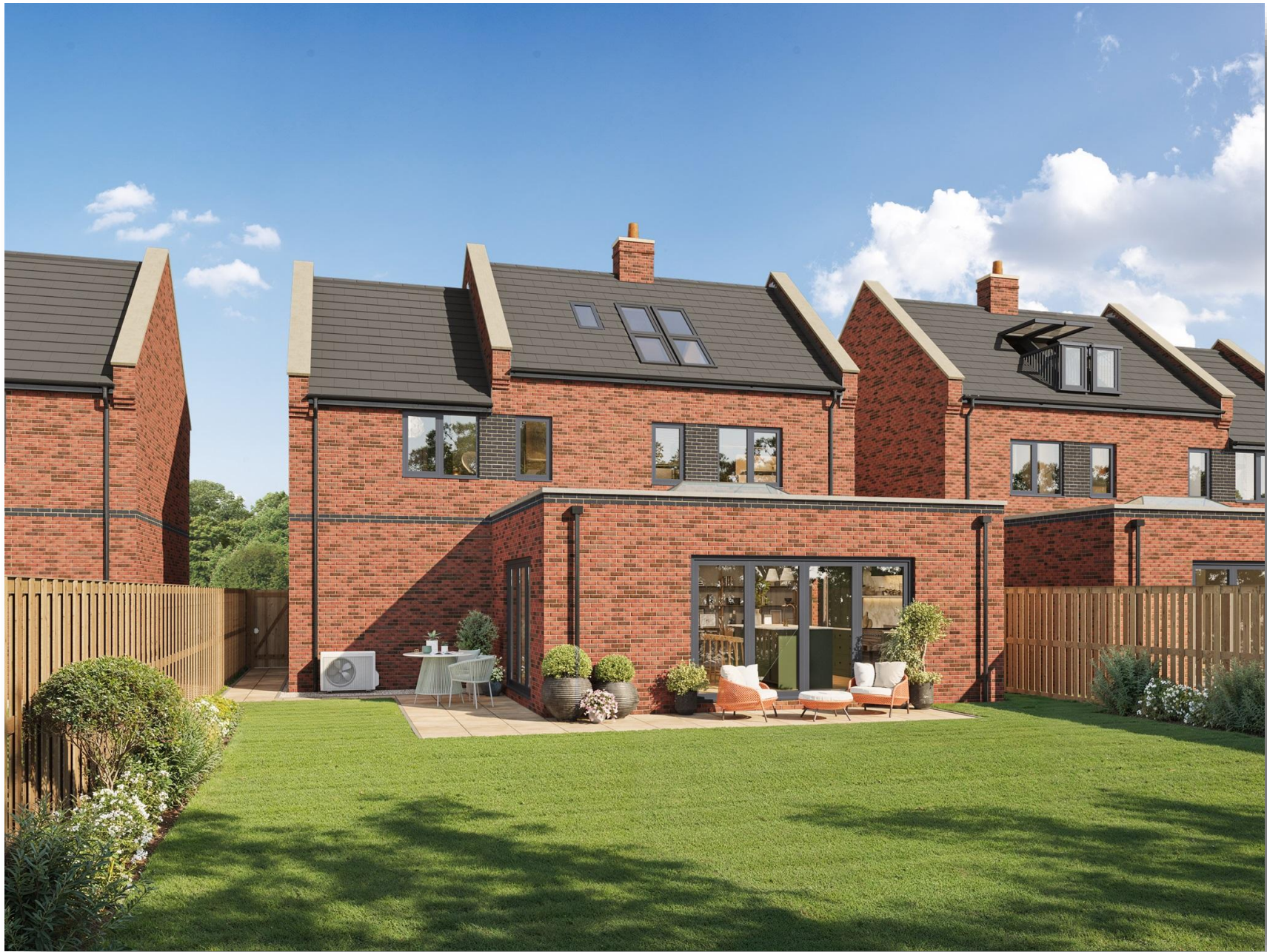
The Old Farmstead Old Main Road, Bulcote Nottingham NG14 5HA