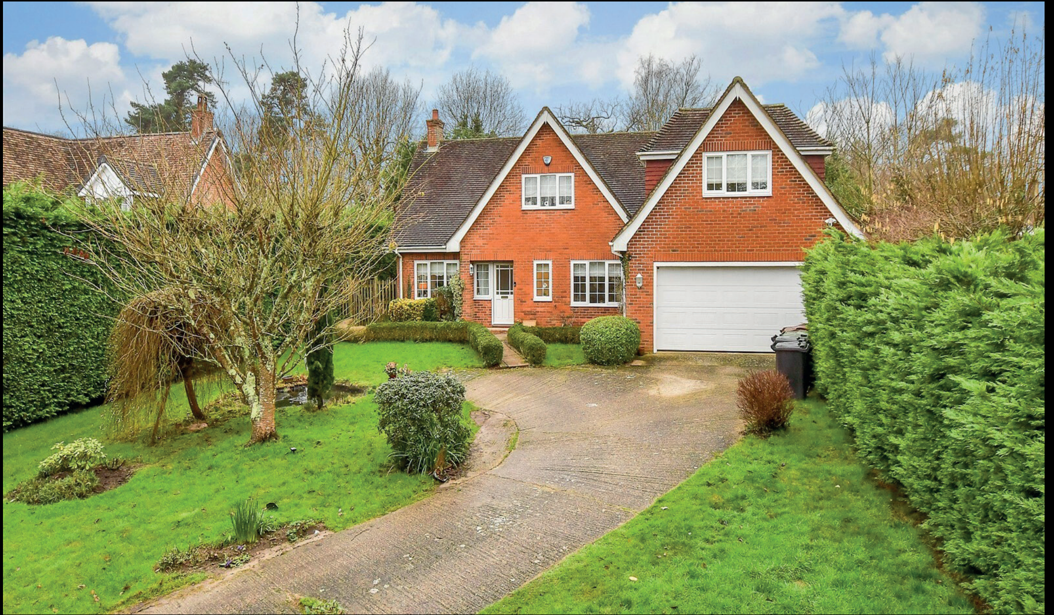
The Limes Cornford Close | Tunbridge Wells | Kent | TN2 4QP