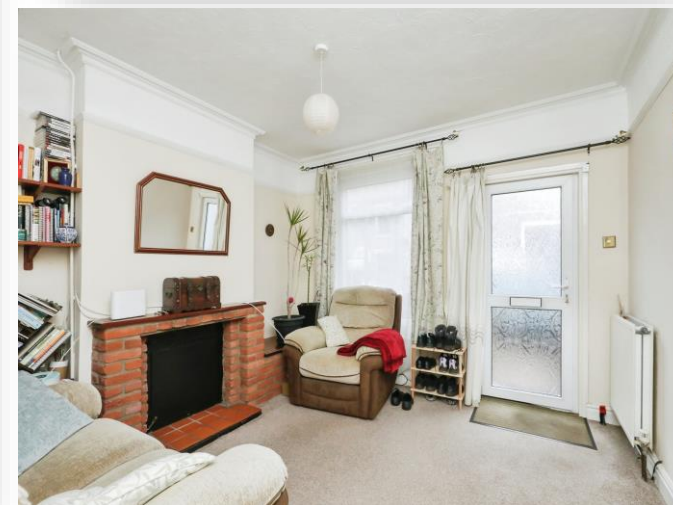
Cyprus Street, Norwich, NR1 3AX