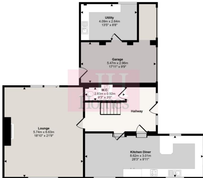
Ground Floor Approx 117 sq m / 1255 sq ft

This floorplan is only for illustrative purposes and is not to scale. Measurements of rooms, doors, windows, and any items are approximate and no responsibility is taken for any error, omission or mis-statement. Icons of items such as bathroom suites are representations only and may not look like the real items. Made with Made Snappy 360.