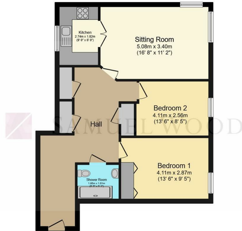
Ground Floor Floor area 68.0 sq.m. (732 sq.ft.)

Total floor area: 68.0 sq.m. (732 sq.ft.)