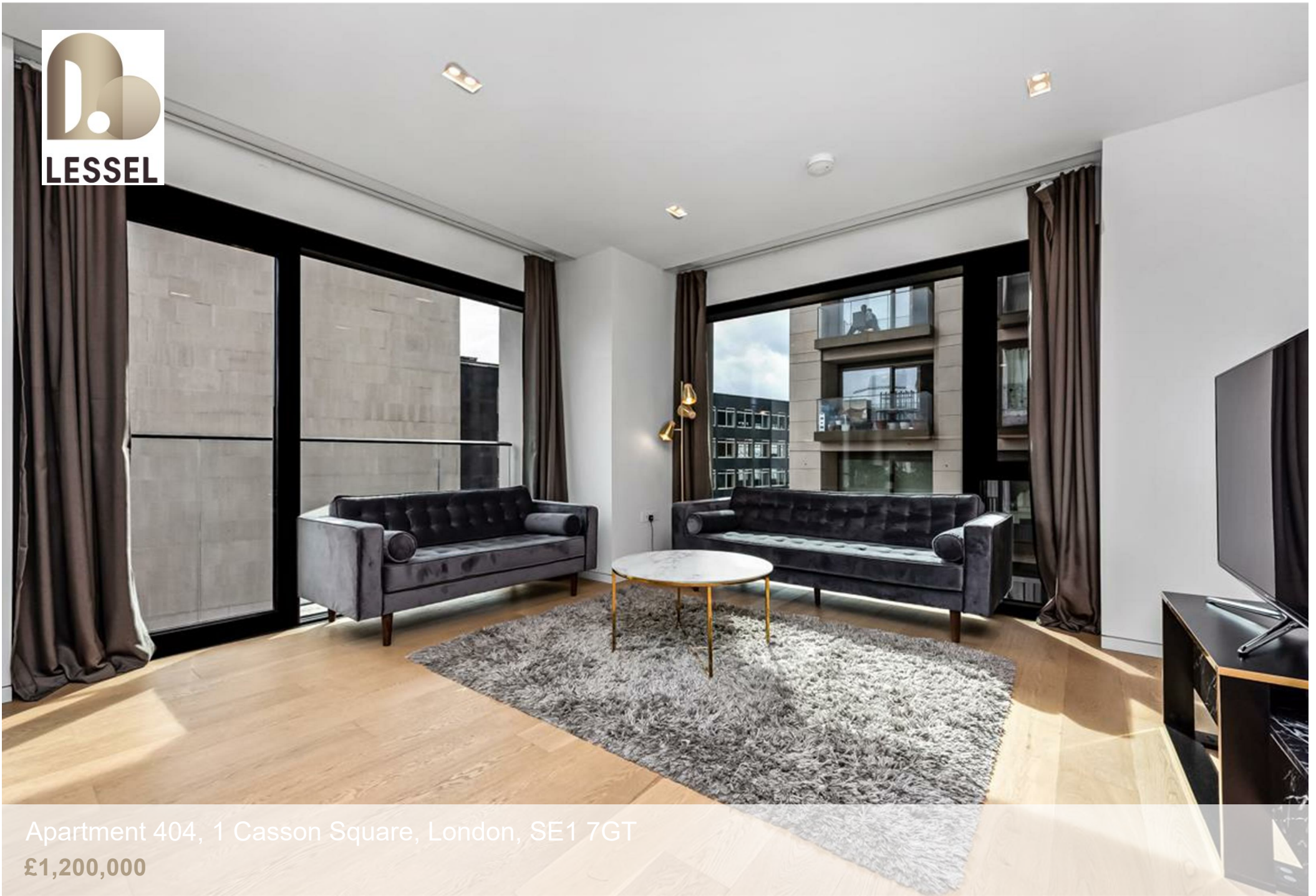
Apartment 404, 1 Casson Square, London, SE1 7GT £1,200,000