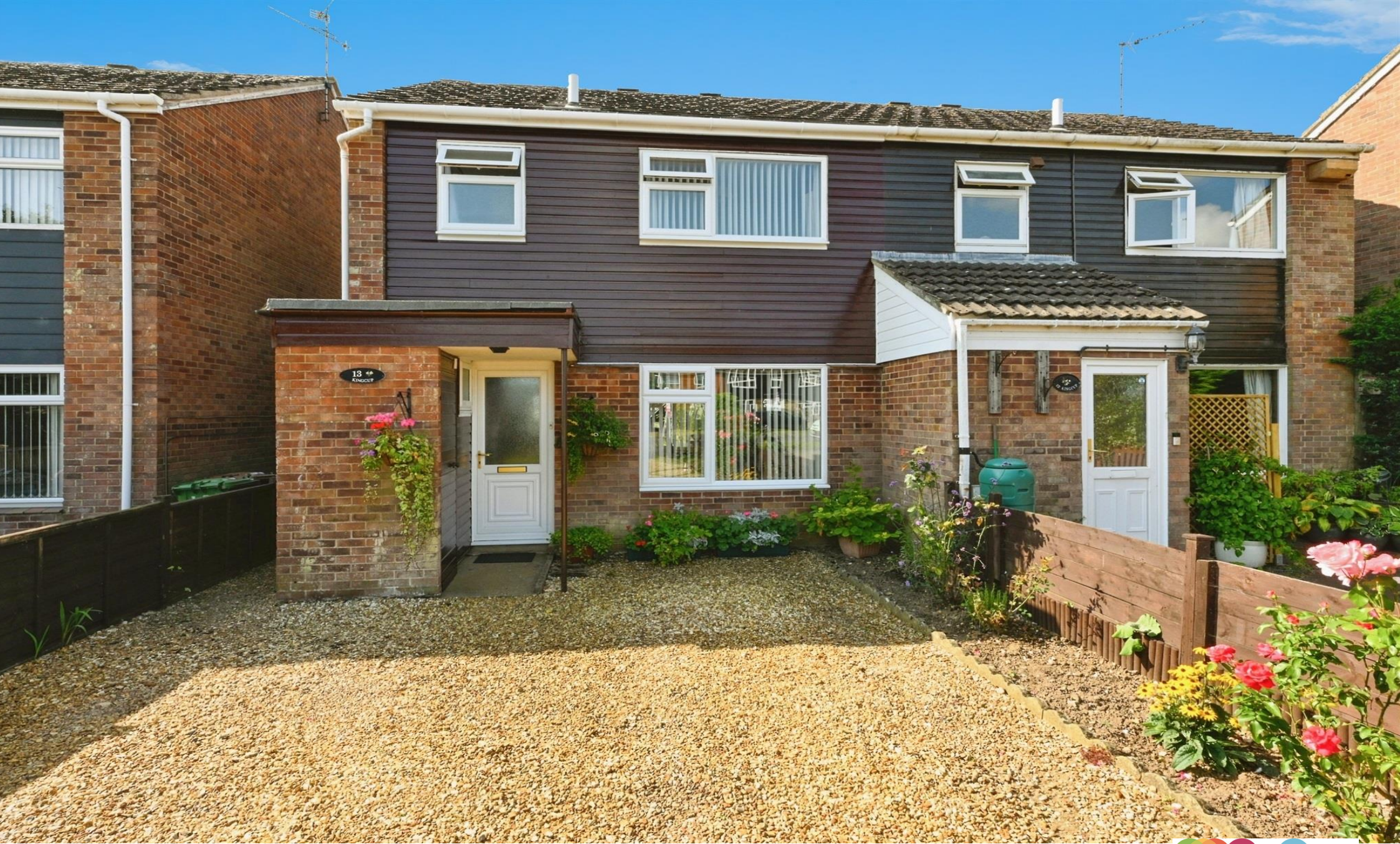
Kingcup, King's Lynn, PE30 3HF