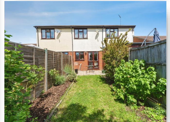
Carpenters Way, Doddington PE15 0RZ