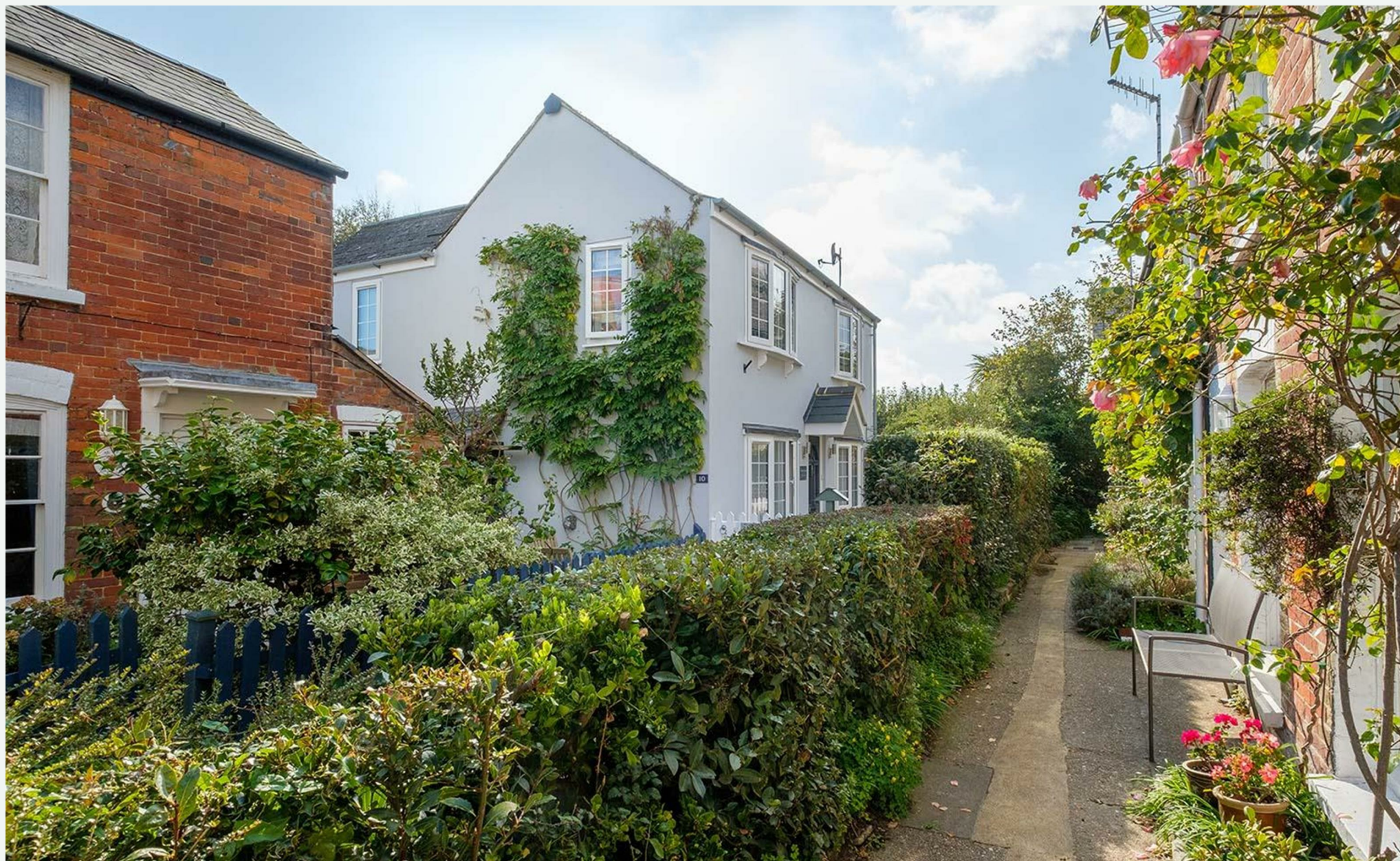
Raglan Cottage, Yarmouth, Isle of Wight