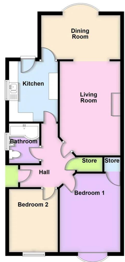
Ground Floor Approx. 75.8 sq. metres (816.3 sq. feet)