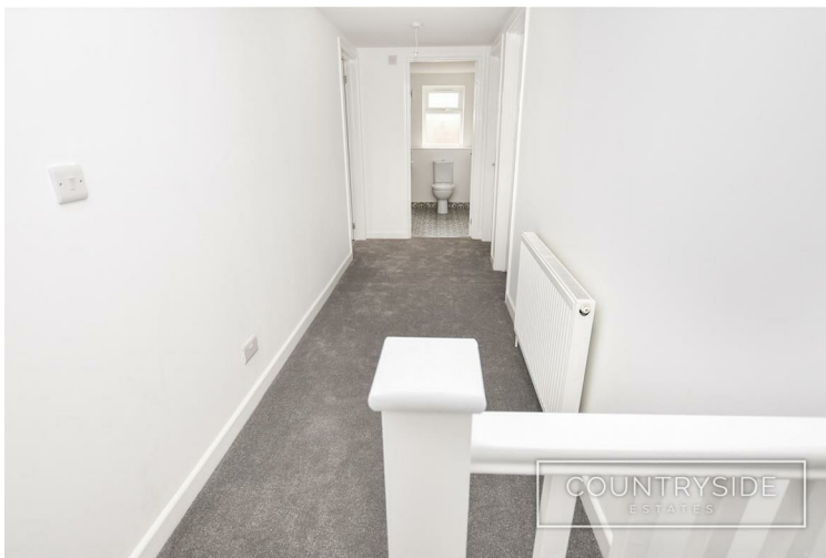
Landing 15'4 x 4'9 (4.67m x 1.45m)

Radiator, two power points, skimmed ceiling, fitted carpet.