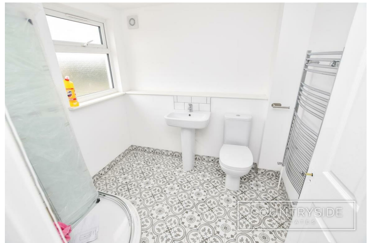
En - Suite Shower Room 7'6 x 7'2 (2.29m x 2.18m)

Window to rear, tiled flooring, chrome towel radiator, extractor fan, corner curved shower cubicle, pedestal wash hand basin, close coupled wc with push button control.