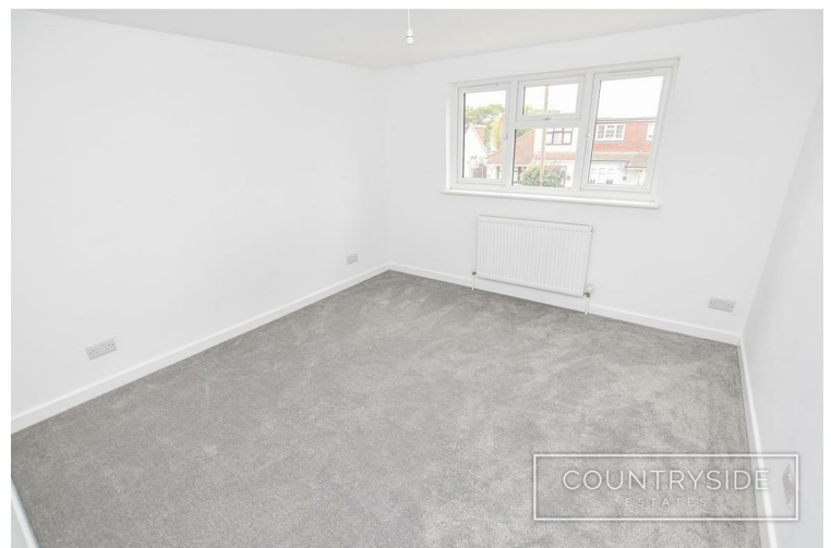
Bedroom Two 11 x 10'9 (3.35m x 3.28m)

Window to front, fitted carpet, skimmed ceiling, radiator, eight power points plus two wall mounted and TV point.