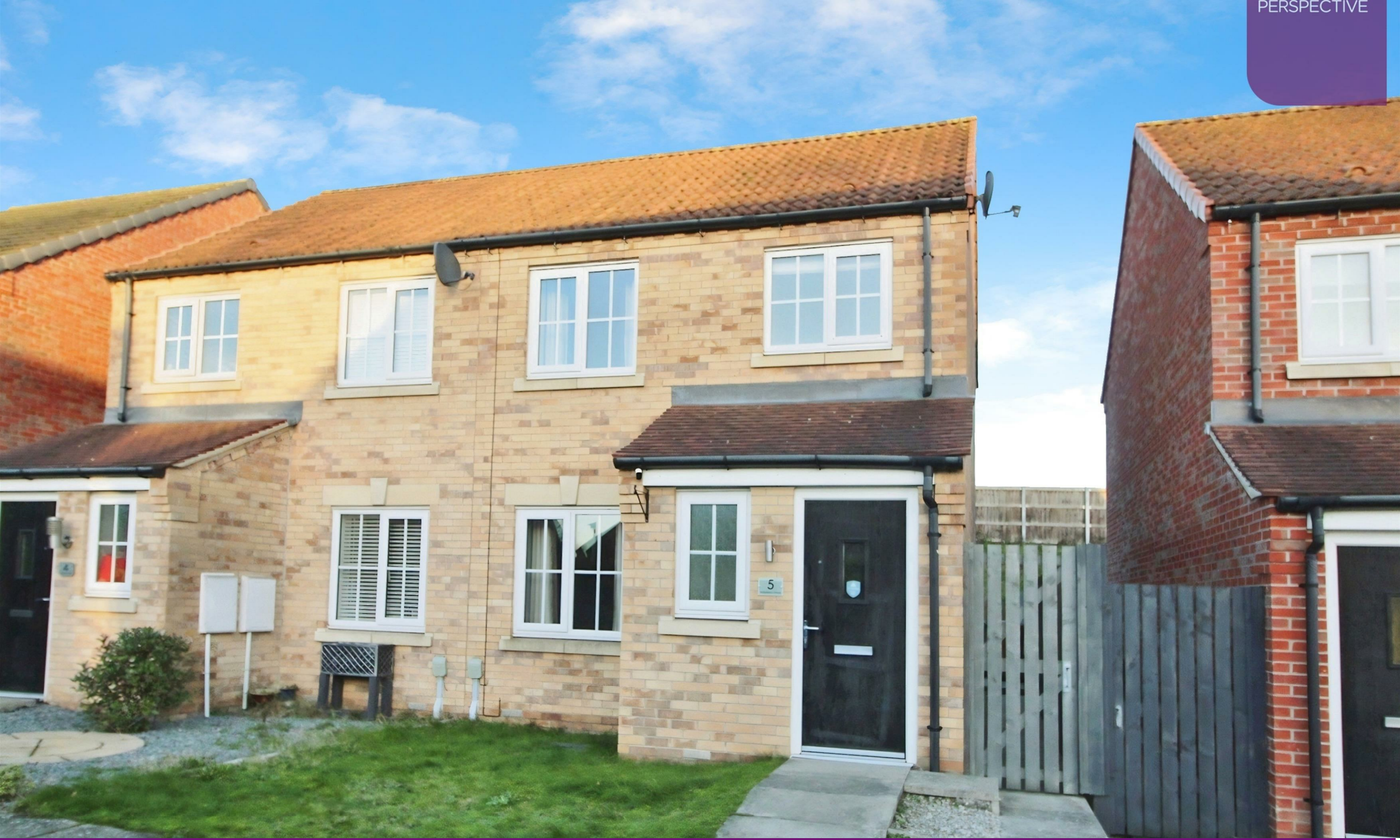
5 Haddon Close, Elloughton, Brough, HU15 1UJ £190,000