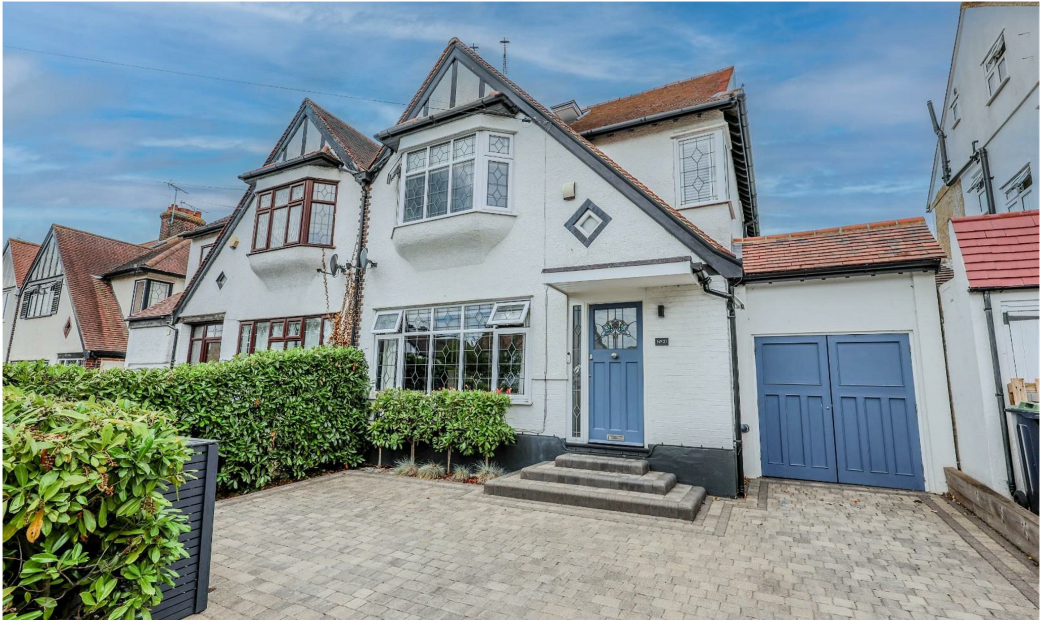
Thames Drive, Leigh-On-Sea £900,000